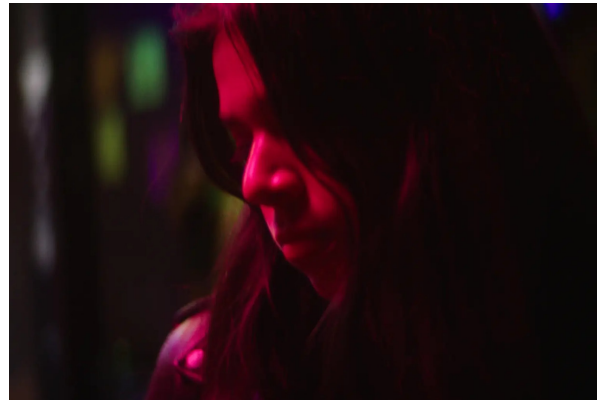
Ask A Punk , a short film by Kevin Contento '18 , will be having its World Premiere at the Miami Film Festival in April.